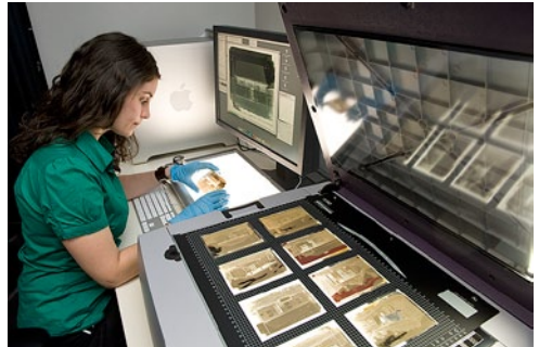
THE LARGE FORMAT GLASS PLATE SCANNER WAS PURCHASED WITH FOUNDATION CONTRIBUTIONS TO DIGITISE THE HOLTERMANN COLLECTION