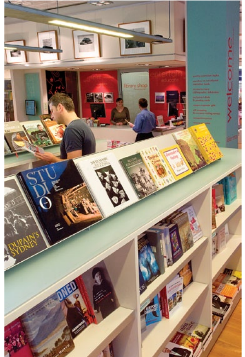
THE LIBRARY SHOP