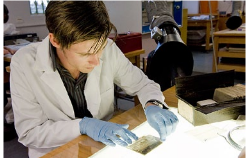
PRESERVING THE HOLTERMANN COLLECTION