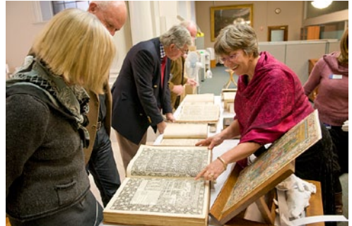
SHOWCASING COLLECTION TREASURES