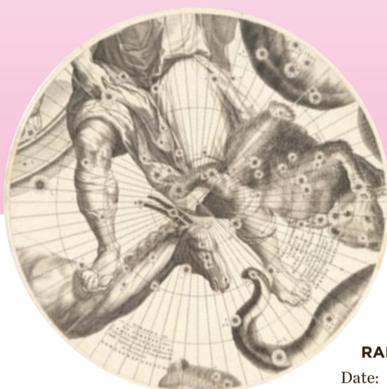
Above: Gerardus Mercator ... Iodocus Hondius ... [portraits], 1619 / Gerardus Mercator

Wanting to enrich the detail in a current manuscript or just have the beginnings of an idea for a writing project? Come along to this program of workshops and talks aimed at helping you to add in the right historical details, including looking for pictures, maps and more.