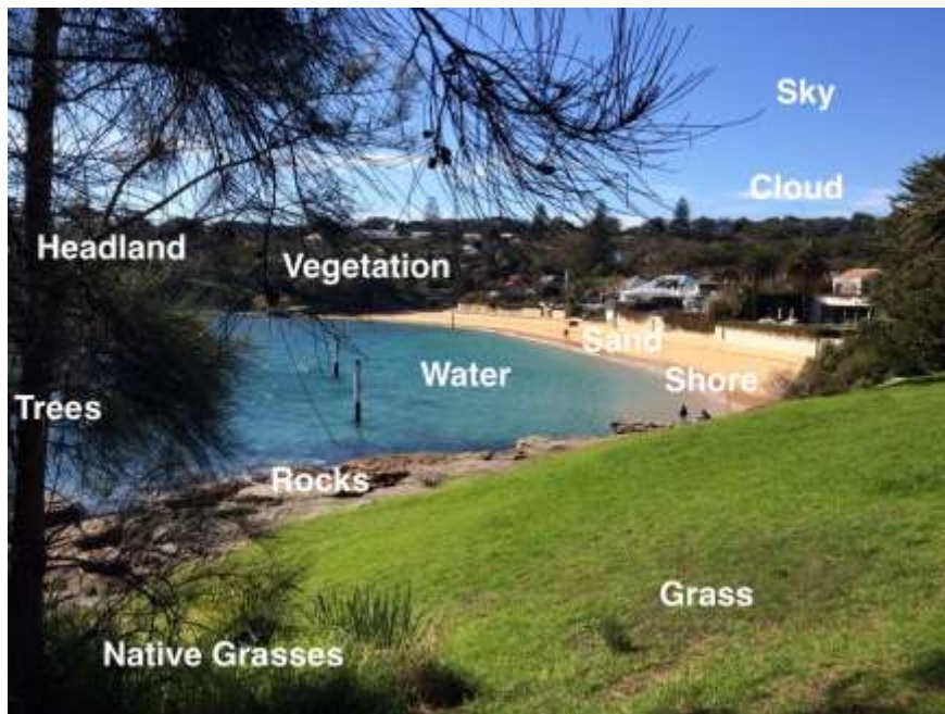
Green Point Reserve, Watson's Bay, 2015, by G Braiding