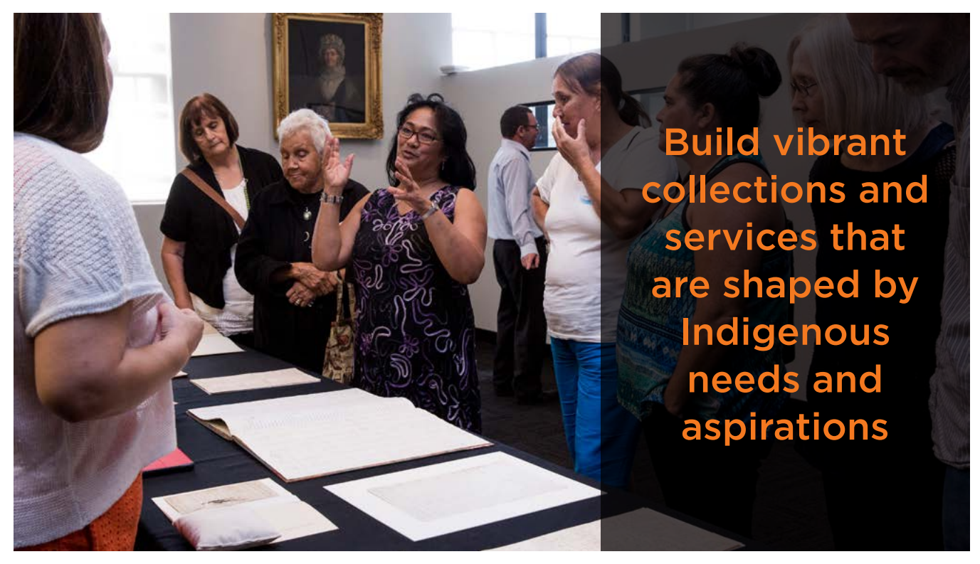
MARIMIRANG: ELDERS AND LANGUAGE, HOSTED AT THE LIBRARY FOR SENIORS WEEK 2014