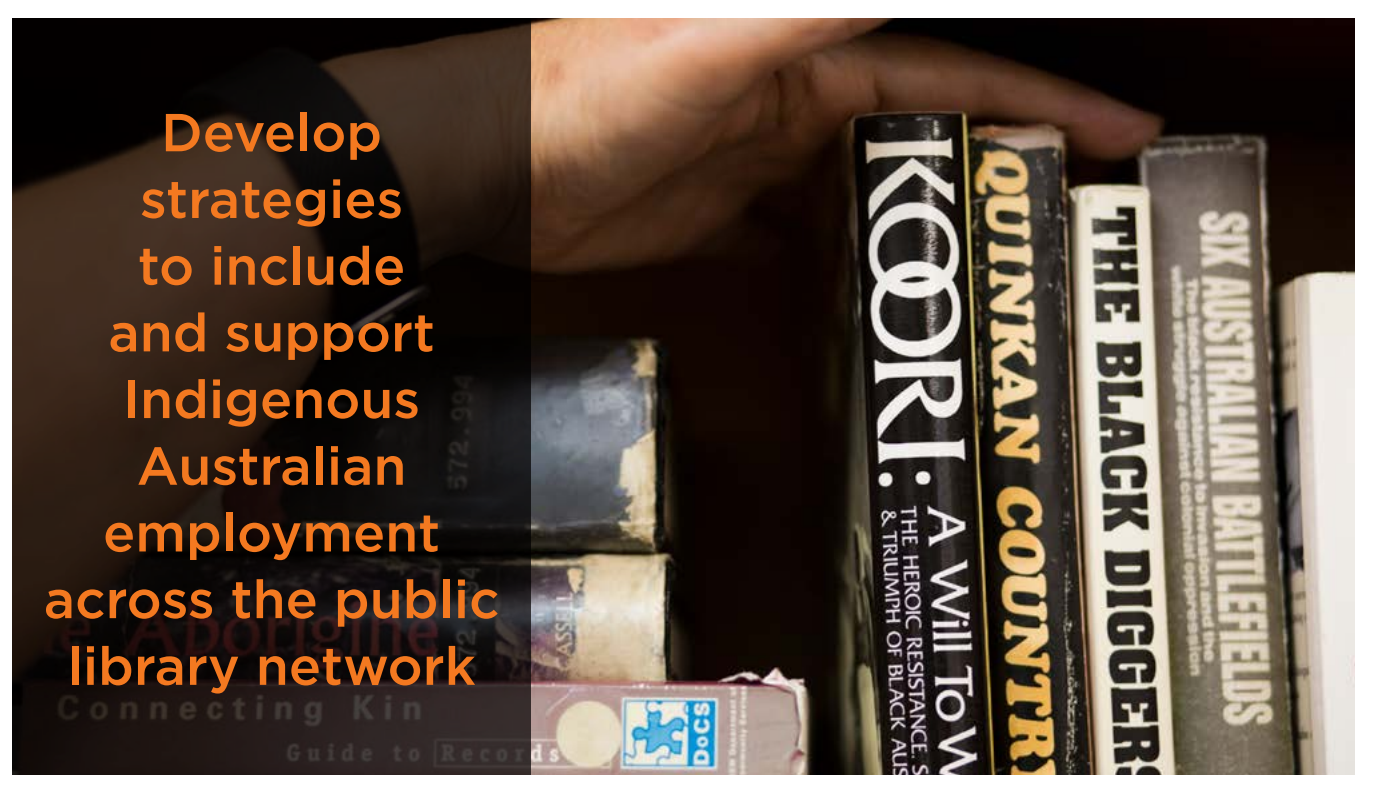
INDIGENOUS PRINTED COLLECTIONS, MITCHELL LIBRARY