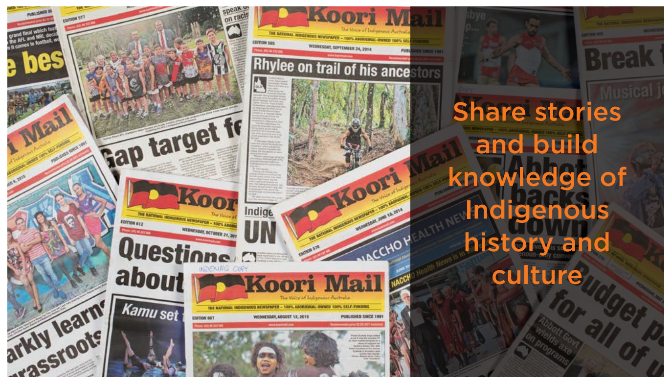
KOORI MAIL MAGAZINE IN THE STATE LIBRARY COLLECTION