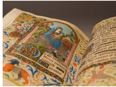
Left: Book of Hours, northern France, late 15th century