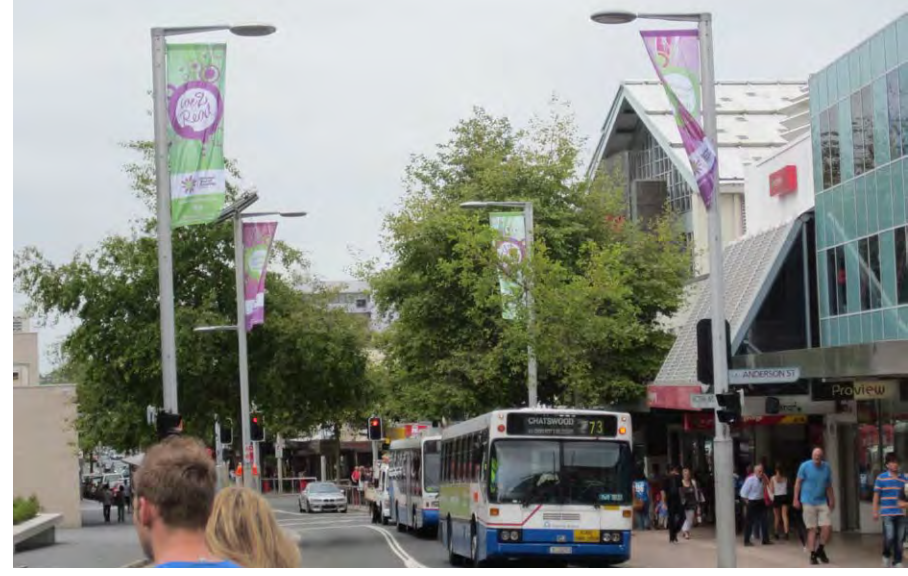
STREET BANNERS IN CHATSWOOD

The National Year of Reading 2012 has provided Willoughby City Library Services with many opportunities to not only promote the new library, but to also promote the goals of NYR. Willoughby seeks to implement strategies to improve literacy, to publicise the roles of Australian libraries in the