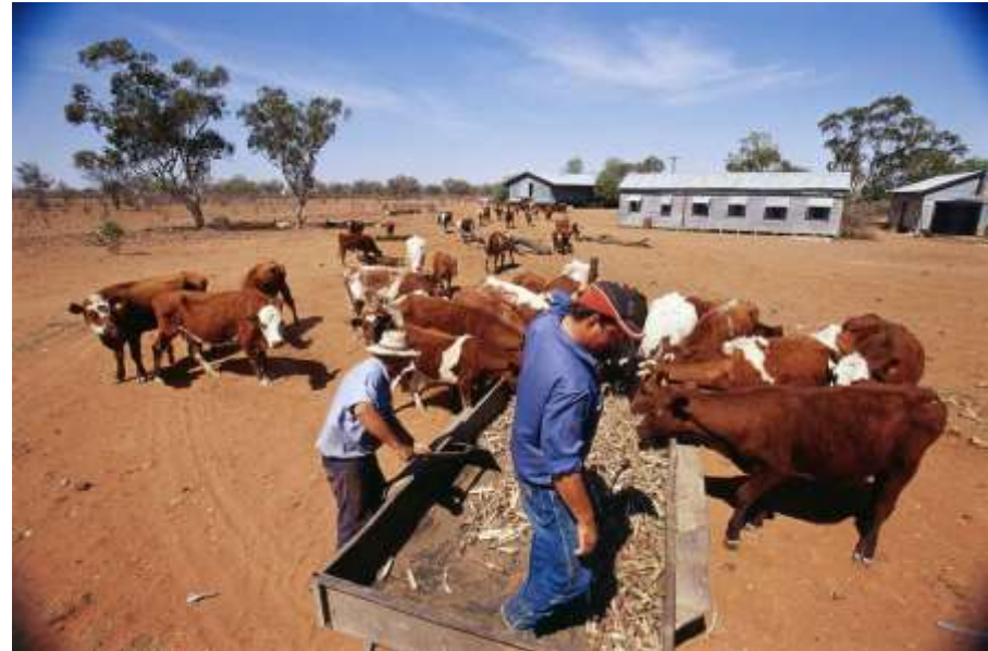
Source 6: Feeding cattle with sugar cane, Dunsandle Property, Enngonia, NSW, 2002, photographed by Darren Clark.

http://acmssearch.sl.nsw.gov.au/search/itemDetailPaged.cgi?itemID=447439