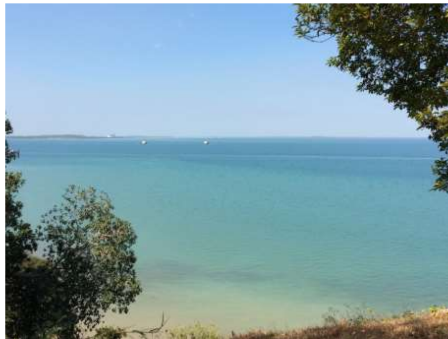
Source 4: Port Darwin, Northern Territory, 2014

http://www.acmssearch.sl.nsw.gov.au/search/itemDetailPaged.cgi?itemID=423858