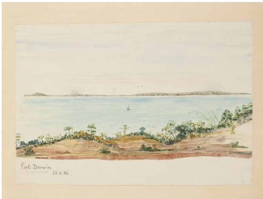
Source 3: Port Darwin, Northern Territory, 1886, drawing by J.E Tenison-Woods

http://www.acmssearch.sl.nsw.gov.au/search/itemDetailPaged.cgi?itemID=423858